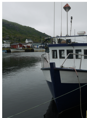
Access to marine resources and the ocean is central to the wellbeing of coastal and Indigenous communities in Canada